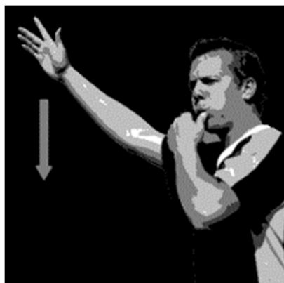
Figure 2: Starting Signal