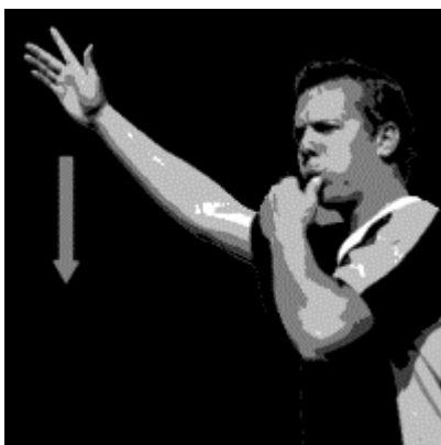
Figure 2: Starting Signal

After a short pause that should be no longer than three (3) seconds, Match Officials will visually check both sides, say 'Ready' whilst simultaneously putting their arm up and then blow a whistle in conjunction with a downward hand movement to initiate the Set, see Figure 2.